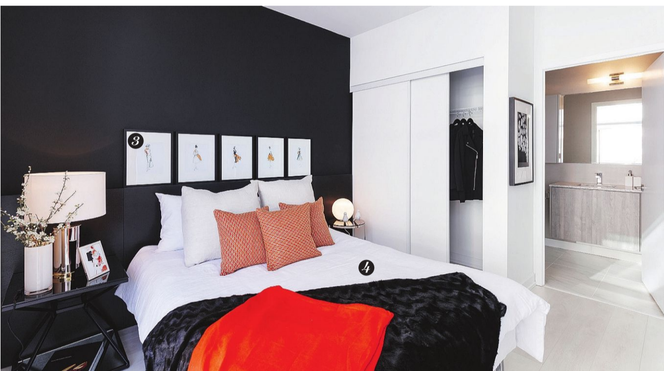
Price range: Starting from the mid $200,000s Location: Sheppard Avenue East and Bayview Avenue, North York

broadloom flooring Amenities A pet spa, home theatre, boardroom, fitness centre, spa area, party rooms, lounge areas and 24-hour concierge Standouts The site will also feature an outdoor pool and hot tub. Sales office Located at 925 Bay St., Toronto. Open Monday to Thursday from noon to 6 p.m. and weekends from noon to 5 p.m. Call 416-861-1111 or visit thebrittcondos.com. L.V., National Post