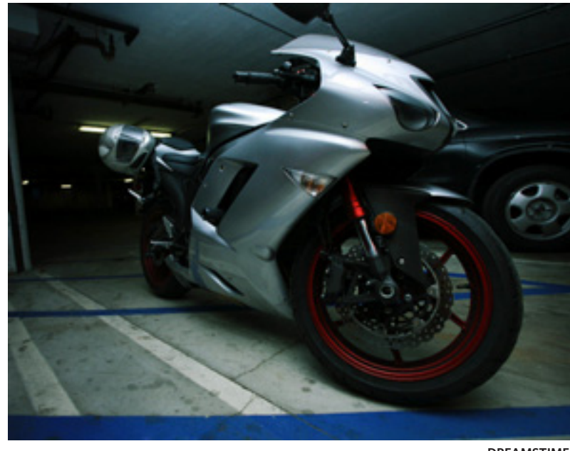
One reader has a building manager who won't allow a car and a motorcycle in the same parking spot.