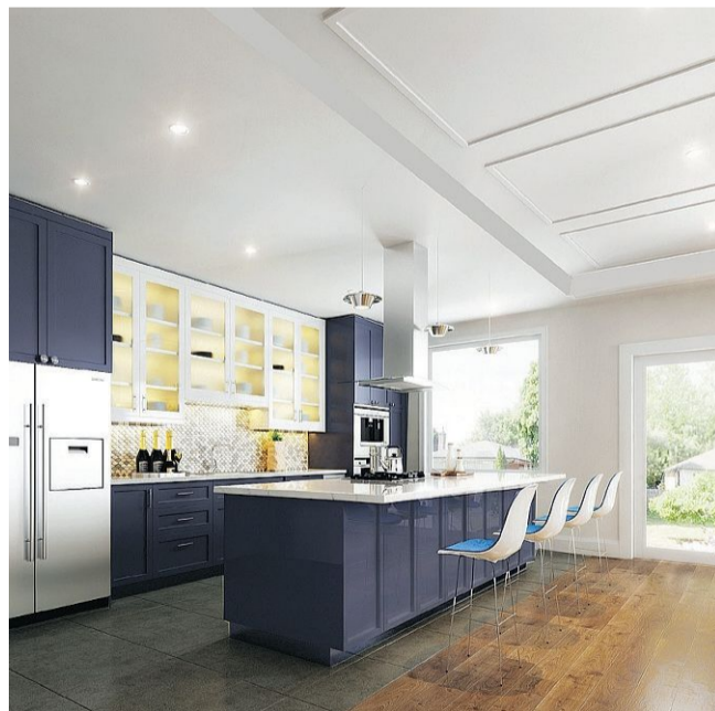
Tailor-made kitchens are the new normal.

THE MORE DETAILED INFORMATION YOU SUPPLY A BUILDER, THE MORE OPTIMAL IT IS FOR BUDGETING