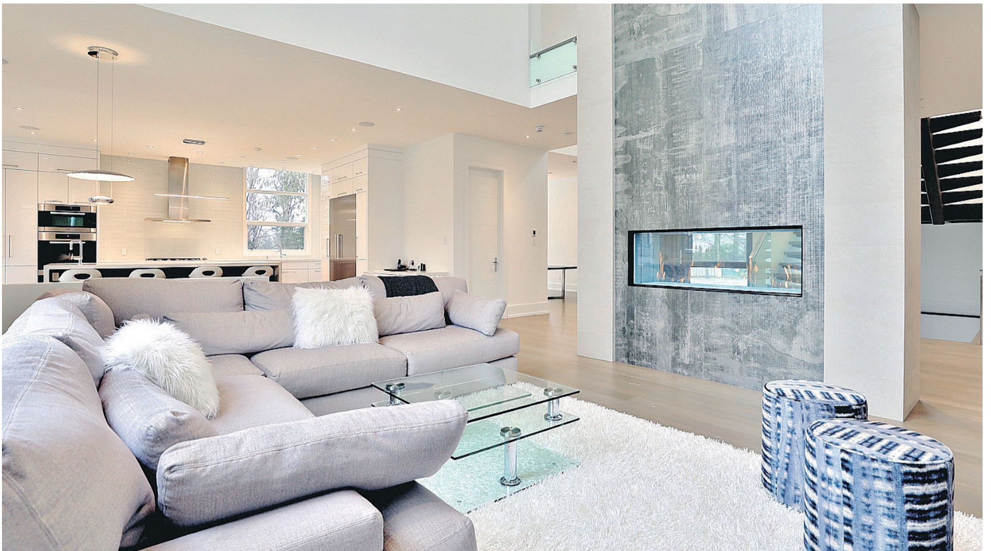
The Scott Group, an Oakville-based company, does renovations and builds two to three houses a year. It cautions that customers should factor in 15 per cent for the unknown.